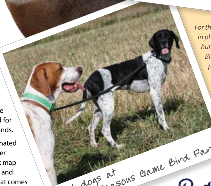
Bird dogs at Four Seasons Game Bird Farm

For those interested in pheasant and chukar hunting, Four Seasons Game Bird Farm may be just the place for you. With 450 acres of diverse terrain, single hunters as well as groups can be accommodated. No license is required; hunting is available by appointment.