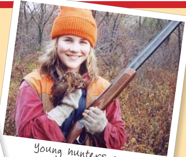
Young hunters are successful too!

Just starting out? Hunter-Trapper Education Classes for beginners 11 years old and older are scheduled throughout the year and can also be found on the game commission website. Special youth hunting programs and opportunities are listed in the Hunting & Trapping Digest .