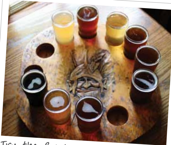
Try the Buck Snort Stout at North Country Brewing Co.

Or just looking for a tantalizing array of smoked meats and delectable treats? Stop by Herb Brittner's Smoke House in Zellenople, Willie's Smokehouse in Harrisville or Thoma Meats in Saxonburg and pick up one of their great smoked meats, jerky, beef sticks or a multitude of other tasty treats! Willie's and Brittner's will also smoke your venison cuts.